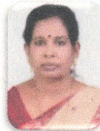
USHA S 3201210381